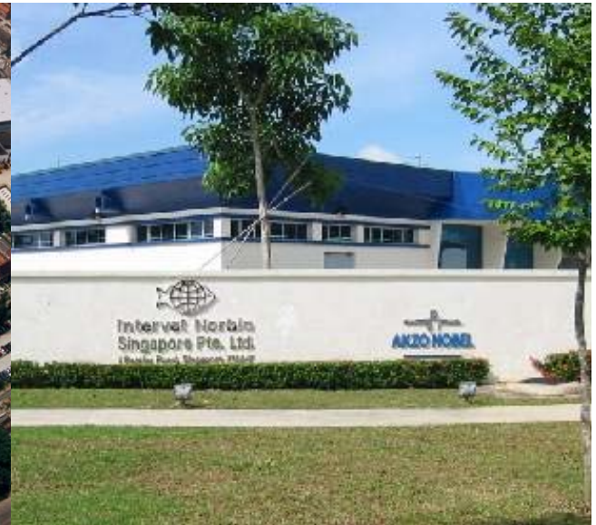
Singapore Temperate & Tropical Fish

Specialising in Fish Vaccines & Therapies