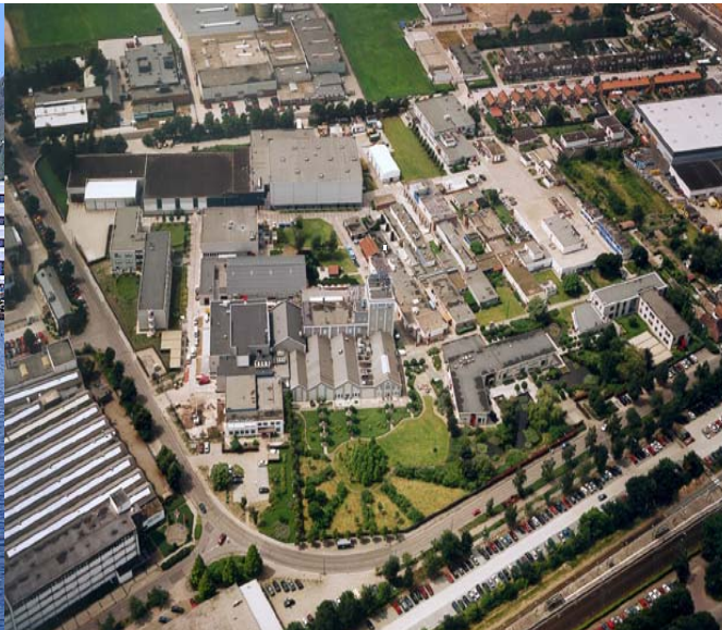
The Netherlands Manufacture