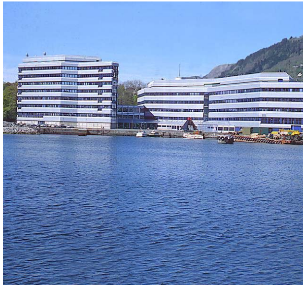
Norway Coldwater Fish